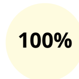
100% Solids Epoxy